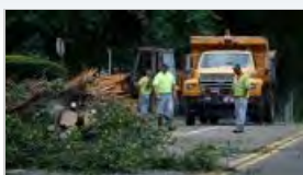
MAP: See hardest-hit parts of LI