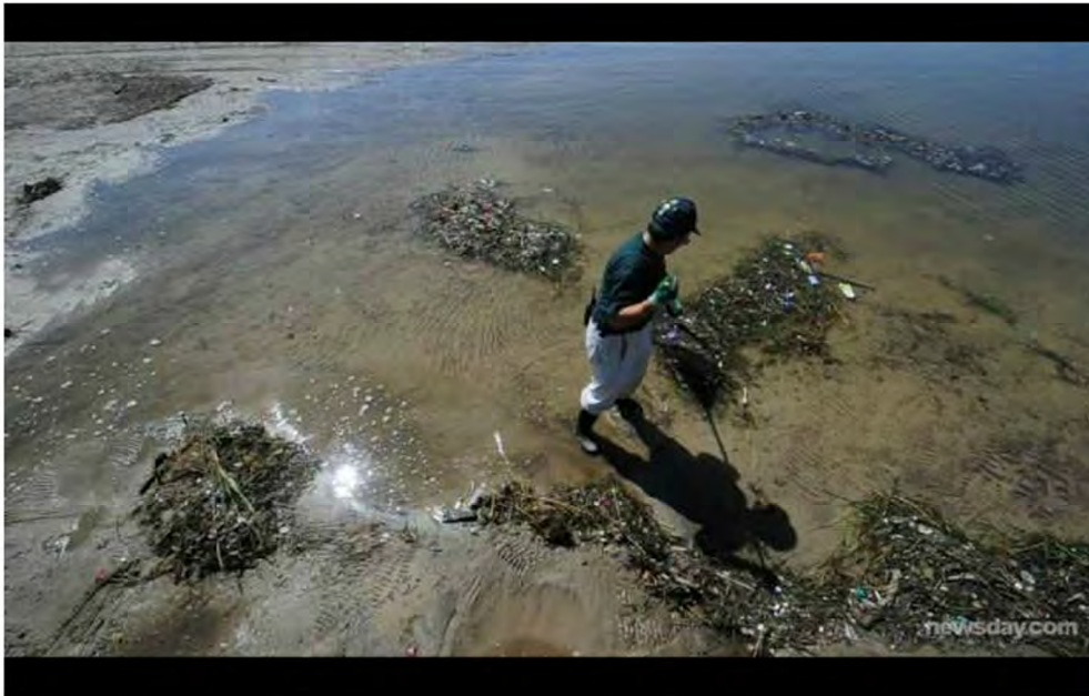
Lifeguards watch for any signs of tropical storm-related erosion during cleanup at Jones Beach State Park. As on other Long Island beaches, crews work to prepare it for Labor Day weekend. (Aug. 29, 2011)

Originally published: August 29, 2011 10:29 PM Updated: August 29, 2011 10:50 PM By BILL BLEYER bill.bleyer@newsday.com