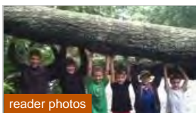
Your storm photos