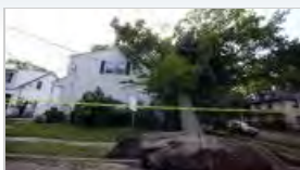
Irene slams Long Island, and the clean-up