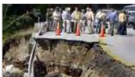
East Coast hit by Irene