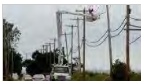
Map: LIPA outages on LI