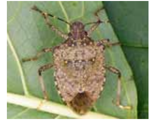
Brown Marmorated Stink Bug

Cape Wind's 130-turbine, 468-megawatt project for Nantucket Sound recently got federal approval for a construction and operations plan. In Rhode Island Sound, Deepwater Wind has applied to federal authorities to build the largest proposed offshore-wind farm in the United States, a 200-turbine, 1,000-megawatt project in federal waters between Block Island and Martha's Vineyard. They would also construct an undersea transmission network stretching from Massachusetts to New York, connecting several states to which the company could sell its power. Recently, manufacturers have brought out 5-6 megawatt turbines in place of 3-3.6 megawatt ones that have typically been installed in Europe and China and are proposed for the Cape Wind project. The larger turbines might be used in a small 5-8 turbine proj-