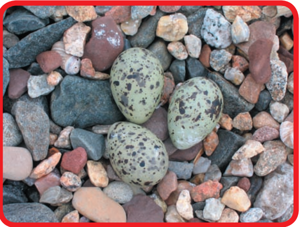
Common tern eggs blend with rocks at Falkner Island.

In addition to habitat management, the refuge also lists environmental education and interpretation among its priorities. Starting this past April, the refuge collaborated with the Friends of the Norwalk Islands to provide curriculum-based environmental education to more than 250 children in the City of Norwalk's public school system. Through a series of four lessons, three in the classroom and the fourth on