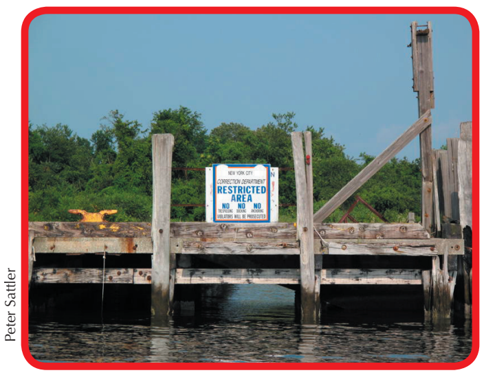
Hart Island has restricted access by order of the NYC Corrections Department.

When I first visited Hart Island during the 1971 summer, Phoenix House and the small STP were in operation. As a provisional STP worker, I was assigned to a package plant operated at Turtle Cove for primary treatment of the seasonal sanitary waste flow from the NYC public beach, Orchard Beach, a man-made facility created under the Robert Moses administration. I went to Hart Island to retrieve a barrel of "perfume", a disinfectant, to add to the raw flow. Subsequently and ironically, the disinfectant was placed in the effluent grating located beneath the windows of the administrative superintendent offices at Orchard Beach. Today, all sanitary waste from Orchard Beach and City Island are pumped to the Hunts Point Water Pollution Control Plant located on the East River. While on the island, lunch was served (macaroni and cheese) at Phoenix House. I remember the skylights with bars which reminded me of the many prisoners who probably shared meals in the same room.