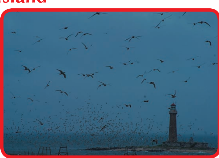
Great Gull Island is used as a nesting ground by 43 percent of the rosate tern population in North America.

Great Gull Island is located at the far eastern end of Long Island Sound. Although only 17 acres in size, this island is critically important to the survival of two species of tern that migrate to the northeast each spring to nest on coastal islands and beaches. The common tern (Sterna hirundo) is considered a threatened species in New York and the roseate tern (Sterna dougallii) has been listed as endangered both in NY and federally, offering it protection under the Endangered Species Act.