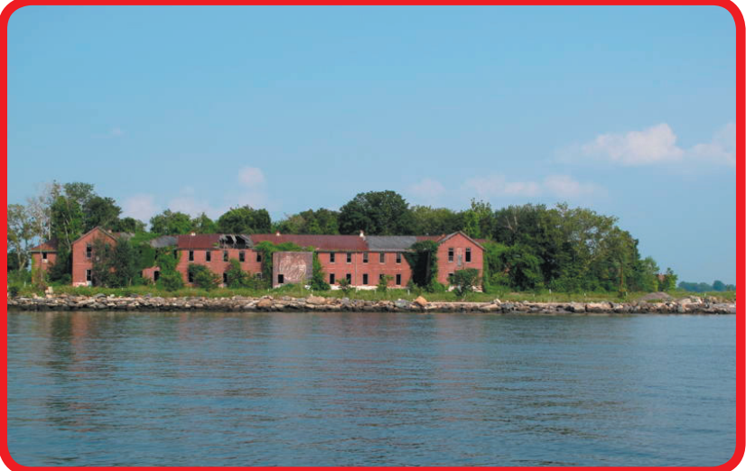
Hart Island has much history, including this original prison building, which was used by Phoenix House.

Hart Island (about 1.0 mi x 0.25 mi) is located in western Long Island Sound northeast of City Island, Bronx, NY. Within sight of Hart Island are many tiny Bronx islands including The Blauzes, Chimney Sweeps, East Nonations and South Nonations, High Island, and Rat Island. To the east, Westchester County islands include Davids, Columbia, Huckleberry, and Pea. To the south across Long Island Sound is Nassau County, Long Island. A short ferry ride