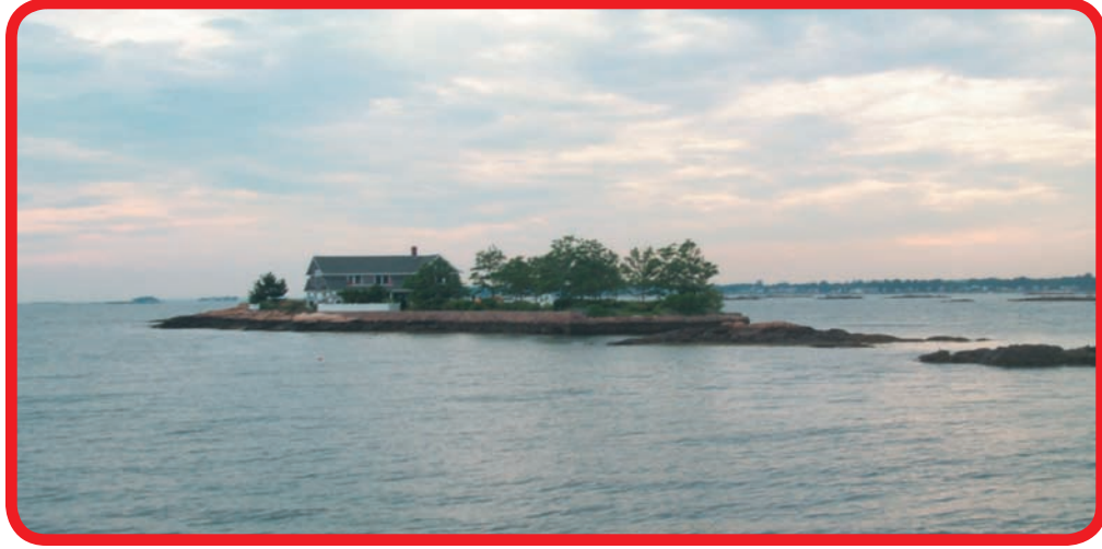
Potato Island, shown above, is just one of the many islands that make up the Thimble Islands.

Since their creation, the Thimbles have seen a variety of human inhabitants. There is evidence that the Mattabesec Indians used the islands as their summer camping grounds, calling them