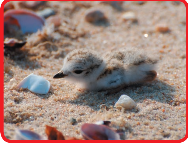
Plum Island is home to many different species of birds, like this piping plover chick that was spotted at the beach off Ft. Terry.

During the American Revolution, Plum Island and the Long Island Sound became a rendezvous for British warships. In August 1775, George Washington ordered troops to Oyster Point to defend Long Island from the British. In what is thought to have been the first clash between the British and the colonists, General David Wooster sent 120 men to Plum Island, where their first amphibious landing on August 11 was met by British fire.