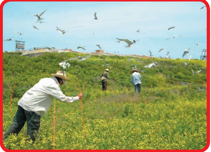
Volunteers mark tern nests with orange stakes as well as count eggs and band chicks.

Both common and roseate terns lay their eggs in nests they build on the ground. The adult terns dive into the ocean and Long Island Sound to catch small bait fish, such as sand lance ( Ammodytes spp.) and Atlantic herring ( Clupea harengus ), which they carry back and feed to their young throughout the summer. The survival of their young each year is directly tied to their ability to find adequate food near the island. Later in the season when the young are able to fly, they must learn to find their own food.