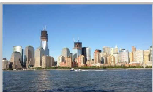
New York City.

Resilient Communities and Economies is one of Sea Grant's four Focus Areas identified in the 2014-17 National Strategic Plan. As such, Sea Grant will continue to support cutting-edge research in the areas of marine-related energy sources, climate change, coastal processes, energy efficiency, hazards, storm water management and tourism. Sea Grant programs engage their diverse and growing coastal populations in applying the best-available scientific knowledge to address increased resource demands and vulnerability. Ultimately, Sea Grant will bring its unique research and engagement capabilities to support the development of resilient coastal communities that sustain diverse and vibrant economies, effectively respond to and mitigate natural and technological hazards and function within the limits of their ecosystem.