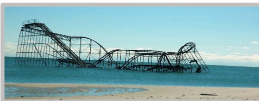
The Jersey Shore.

Sea Grant has more than 360 extension agents who live in, and are closely connected to, the communities they serve. When disaster strikes, Sea Grant agents are uniquely positioned to identify existing resources and help disaster recovery experts work within the community. Seventeen Sea Grant programs along the east coast and Great Lakes serve communities affected by Sandy, to address impacts ranging from increased erosion in Florida to the devastation of entire communities in New York and New Jersey. Sea Grant agents' trusted reputations allow them to be effective liaisons within local governments. The strong community relationships allow agents access to isolated populations, such as rural fishing communities, even in the aftermath of a disaster. While the impacts from the storm will be felt for years to come, the hard work and long-term investments in resiliency research and outreach by Sea Grant has helped communities become more resilient in the face of coastal hazards like Hurricane Sandy.