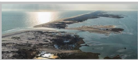
The Fire Island breach.