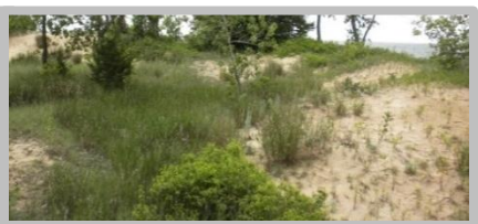
Coastal Dunes.