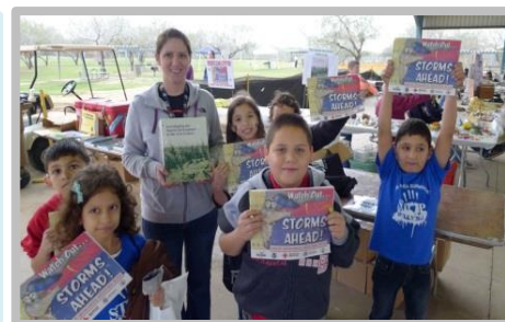
Sea Grant extension agents teach the whole community about coastal hazards.

About Sea Grant: The Sea Grant model integrates research, outreach, and education for science with real world impacts. To share and explain new research discoveries, engage citizens in decision-making processes and empower stakeholders to address national, state and local issues as they emerge, Sea Grant takes a multi-faceted approach to outreach through programs of education, extension and communication. Specialists in each of these areas translate research into usable information and products for many audiences, ensuring that scientific information is delivered to those who need it, and in ways that are relevant.