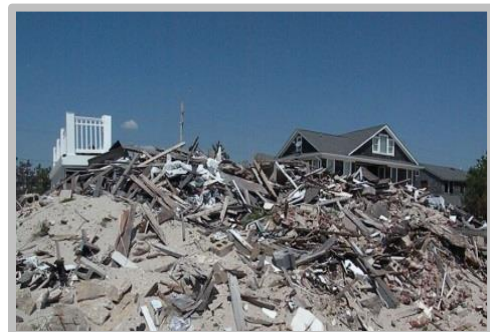
Destruction from Sandy in Mantoloking, New Jersey.

To improve public understanding and awareness of natural hazards and associated risks, NOAA Sea Grant awarded a $1.8M grant to the Connecticut, New Jersey, and New York Sea Grant Programs to support the Coastal Storm Awareness Program (CSAP). This grant will fund social science research to enhance the Nation's ability to respond to disasters.