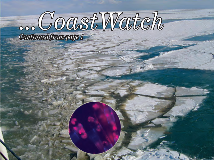
Productivity in Lake Erie is greater in winter than in summer. The Coast Guard cutter reveals streaks of brownish silt containing filamentous diatoms as it cuts through lake ice. Microscopic inset: Fluorescence is used to show the silica structure within filamentous diatoms.