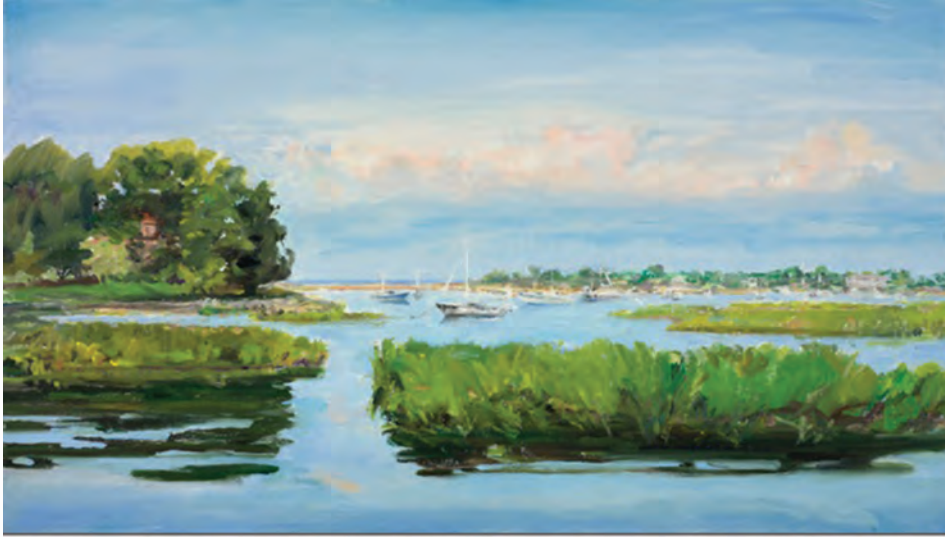
Mount Sinai Harbor on Long Island's north shore, one of 50 Long Island Sound embayments being studied for the risk of eutrophication in a newly-funded research project. Oil painting and photo by Joan Branca