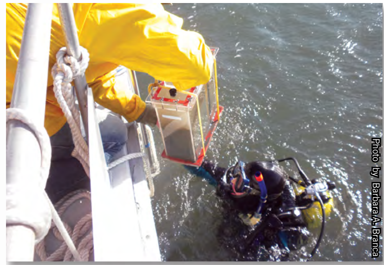
Sea Grant Scholar Stuart Waugh brings up a box corer full of sediment.